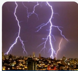
NBR-5419 PROTECTIONS IN STRUCTURES AGAINST ATMOSFERIC DISCHARGES