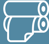
Paper and Cellulose