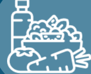
Food and Drinks