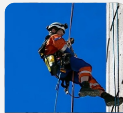
NR 35 JOB IN HEIGHT