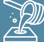
Ironworks and Metallurgy