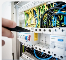
NR 10 SEGURANÇA EM INSTALAÇÕES ELÉTRICAS

Ensuring the safety of our employees is a non-negotiable value that permeates each and every job we perform. That's why, in addition to strictly following all applicable regulations, we constantly invest in training to strengthen a culture that protects our main strategic resources: the talents we count on.